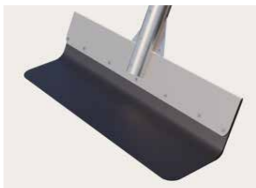
Steel spatula used for the spreading of the Matacryn Tack Coat No1