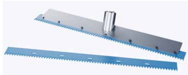
6mm 'V' notched metal trowel with PU squeegee