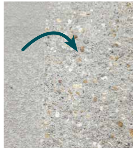
Concrete blasted, scarified, or grinded to an open texture exposed aggregate finish