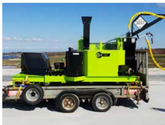
Hot Melt processing equipment