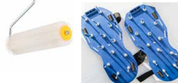
Spike roller and spike over shoes.

Once the Matacryn Manual Membrane has been leveled with the 6 mm 'V' notched squeegee or 'V' Notched trowel, it must be rolled with a Spike Roller. This releases any trapped air from the mixing and pouring activity and helps to also level out the Matacryn Manual Membrane.