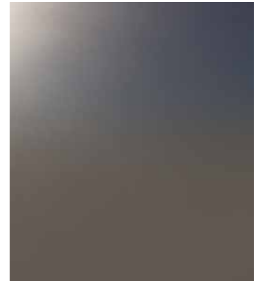
Steel blasted to ISO SA 2 1/2 with profile 50 - 70 micron finish