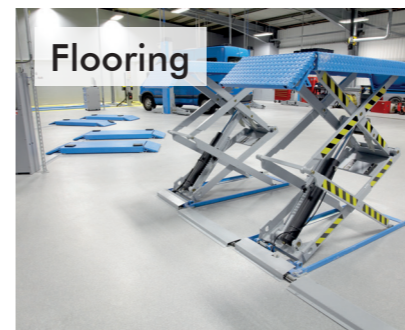
Seamless Resin Flooring, Subfloor Preparation, Car Parking Structures