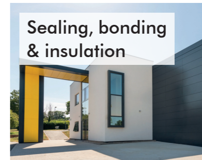
Window Insulation, Façade Construction, Exterior Insulation & EIFS, Structural & Inplant Glazing, Insulated Concrete Forms (ICFs)

The product brands housed within Tremco CPG Europe cover a wide array of different construction needs and provide a wealth of complex services, support and systems that are rarely found together under one roof.