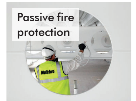
Intumescent Coatings, Fire Stopping