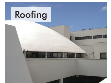
Liquid Applied Systems, Felt Systems, Vegetated Roofing