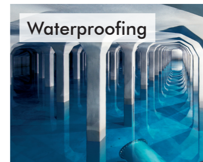
Potable & Waste Water Industry, Balconies, Terraces, Basements & Foundations