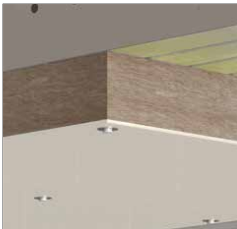
Aesthetically pleasing finish