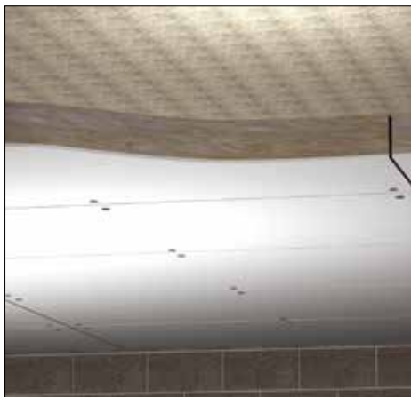
Insulation and soffit upgrade