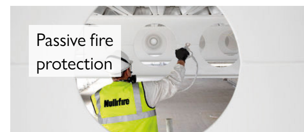
Passive fire protection

Window Insulation, Façade Construction, Exterior Insulation & EIFS, Structural & Inplant Glazing